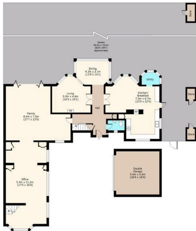
Ground Floor Approx. 212 Sq. meters (2282 Sq. feet)